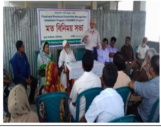
PCM at Zaforgonj on 06/06/16