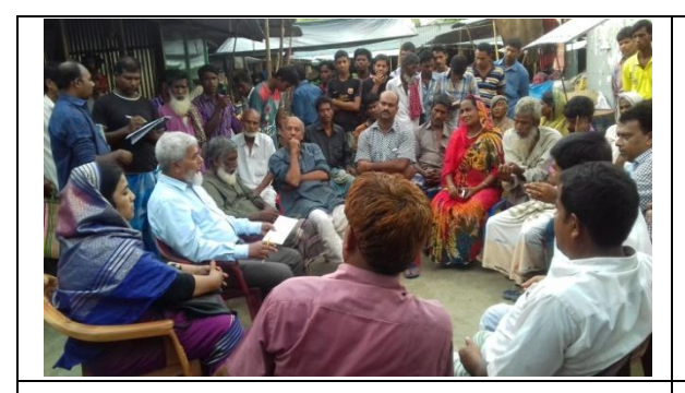
FGD at Zafarganj Bazar on 18/07/16