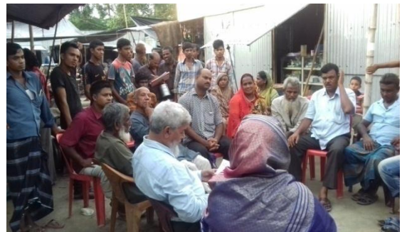
FGD at Zafarganj Bazar on 18/07/16