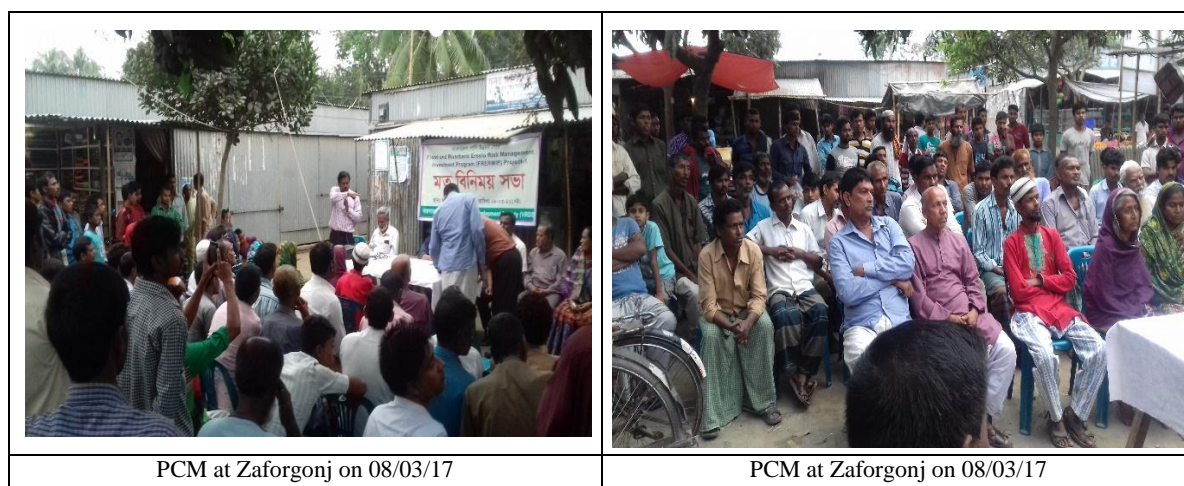
PCM at Zaforgonj on 08/03/17