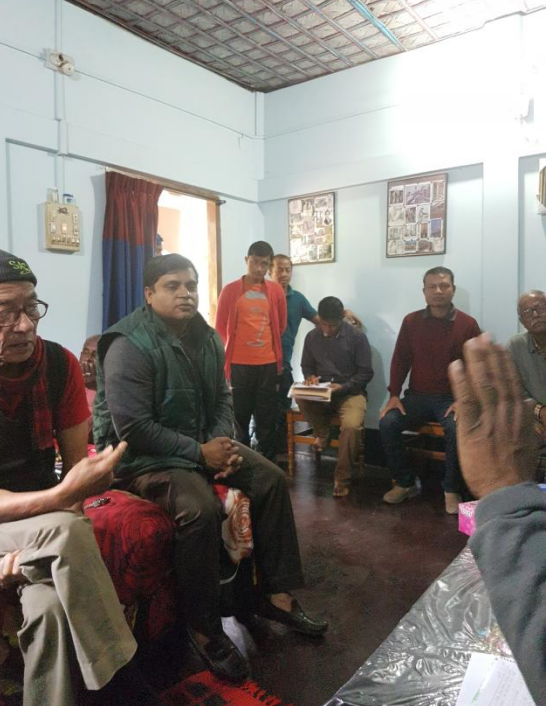
Photographs: Partial views of consultation meeting with the Khasia tribal people held at residence of retired school teacher