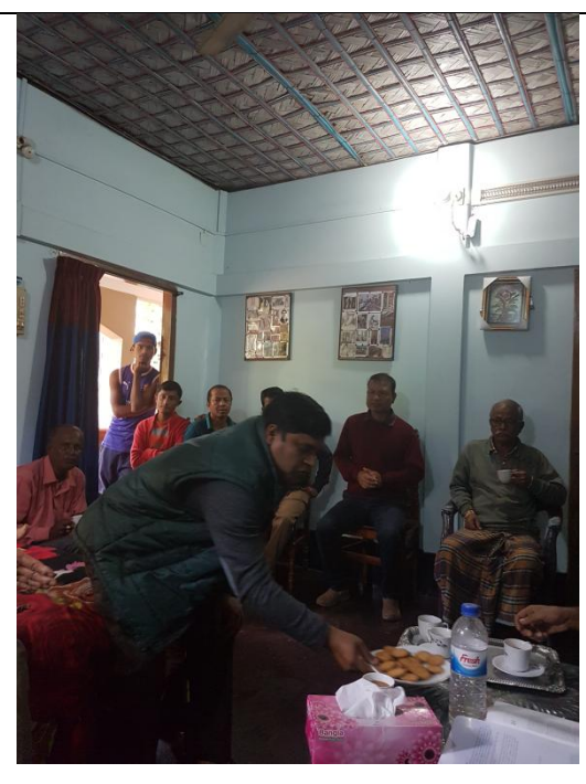
Photographs: Partial views of consultation meeting with the Khasia tribal people held at residence of retired school teacher